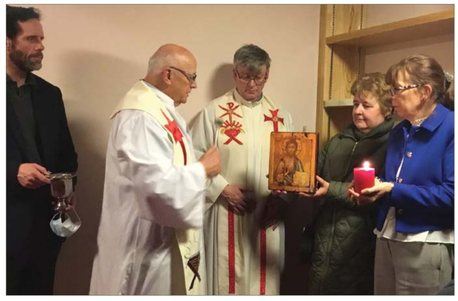
Blessing of the John Main Meditation and Icon Room in Balally

However and whomever we love, love has one source and purpose. When we meet someone and fall in love, or when we let ourselves be mastered by compassion for those in need, we are experiencing God. We are beneficiaries of God's most intimate self-revelation. Pushed into new depths of self-understanding,