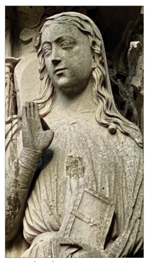
A figure of contemplation, Notre-Dame de Paris

Time shows that metanoia itself is gift. Metanoia is Being's miracle of self-healing for the mind and ego through what is free of the ego-mind. It remakes the mind, retaining its useful qualities but disconnecting the mechanisms of attachment and illusion that make it self-harming. Ramana said that many 'i's (many deluded, false selves) are