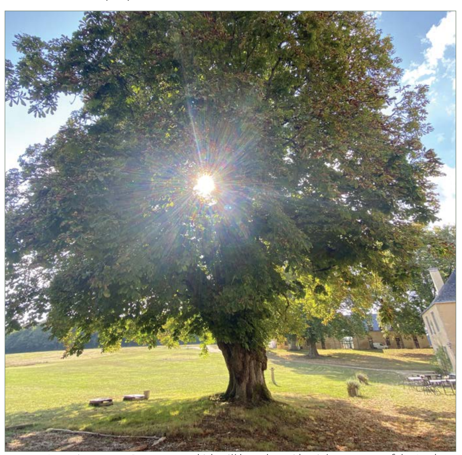
An ancient tree at Bonnevaux, which will host the residential component of the Academy

A TWO-YEAR STUDY AND PRACTICE PROGRAMME GROUNDED IN CHRISTIAN CONTEMPLATIVE TRADITION IN THE SERVICE OF HUMANITY (P 8)