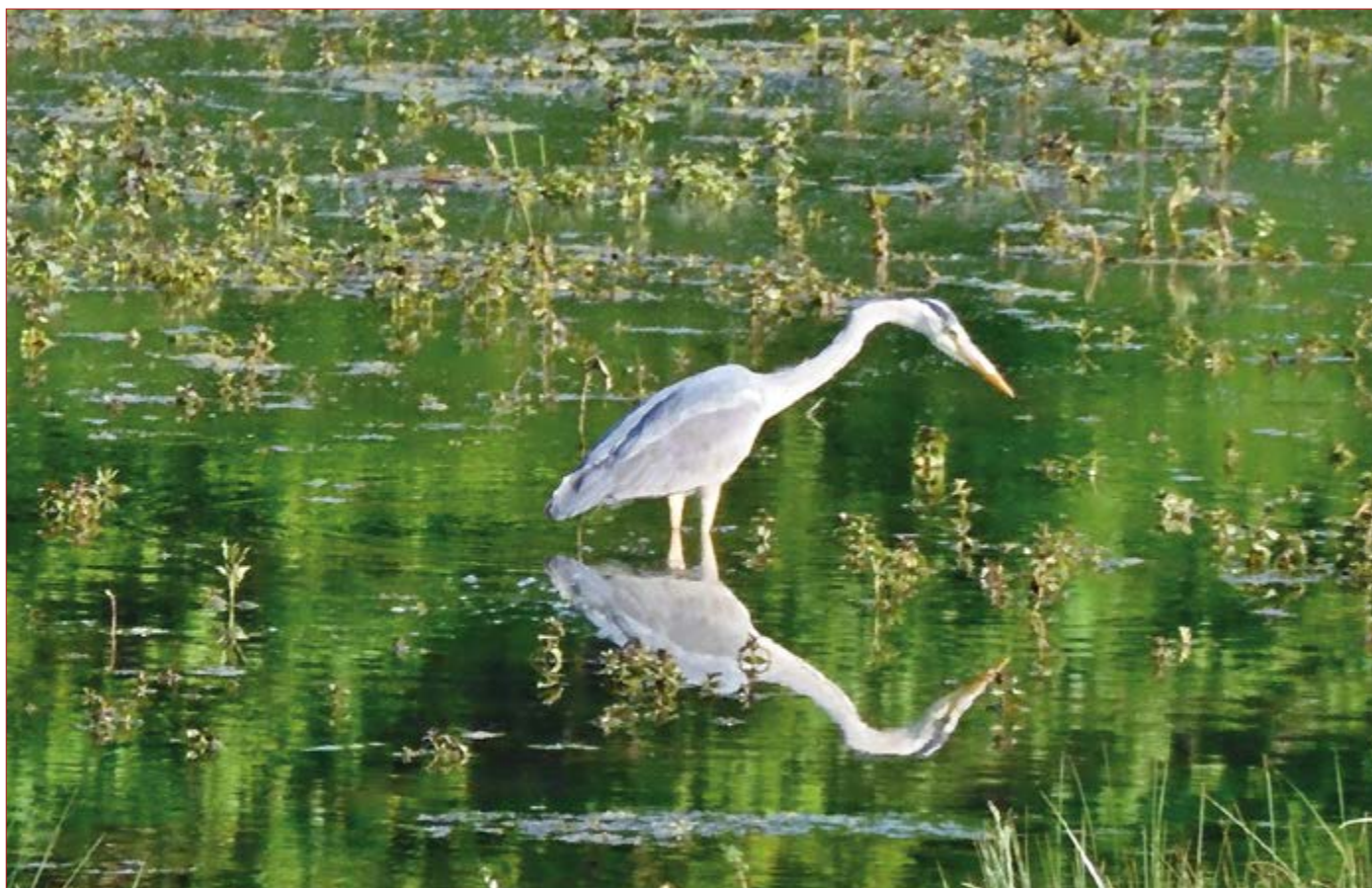
Heron in the lake of Bonnevaux