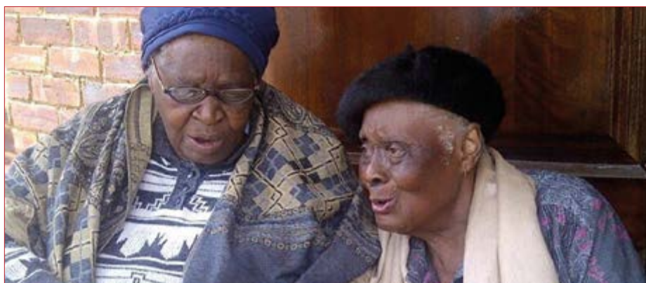
African Spirituality value the wisdom of the elders

Indigenous African spirituality is expressed differently by the variety of indigenous African groups. It does however share certain common aspects. One of these is the centrality of community. Unlike in many places in the north and west, the individual is less important than the community. The well-known proverb (Zulu) umuntu ngumuntu ngabantu/ motho ke motho ka batho ba bang (Sesotho), which means, that a person is a person through other people, expresses this powerfully. Ubuntu is where each person is seen, each person is heard and each person is valued and