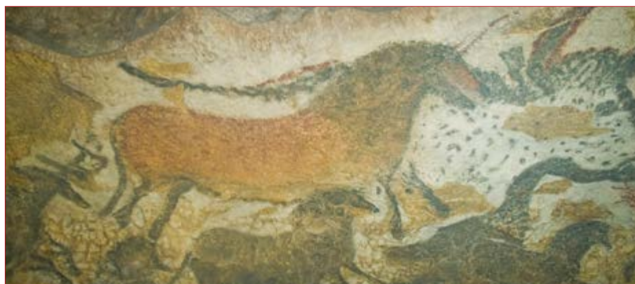
"Lascaux II"

I have always been attracted to caves and rather frightened of them. They are deep, dark, mysterious and offer the promise of treasure. Like the cave of the heart, we have to feel the attraction – or surrender to the accidental discoveries – that introduce us to these sacred spaces. But then we have to be young at heart,