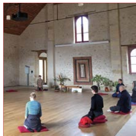
Meditation time at the Barn in Bonnevaux

Looking ahead with hope and faith that the state of the world will improve, we can also share that renovation works on the Bonnevaux Retreat Centre should be completed by June 2021, and an official opening day celebrating this wonderful milestone could be planned for the latter half of 2021. Please continue to visit our website and to join us online for both our Programme and regularly-scheduled weekly events. Please keep Bonnevaux in your prayers - we