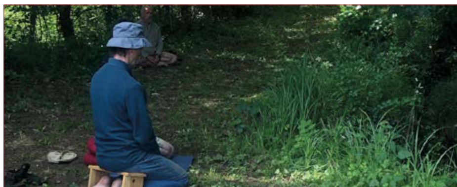
Meditation session in nature at Bonnevaux

nents by artists who had no contact with each other. The painter of the bison in Lascaux or the beautiful horses in the Chauvet caves did not take a selfie in front of them and send it to his WhatsApp group. Yet great similarities, a common mind, may be perceived among them. What they thought we will never know for sure. But what they