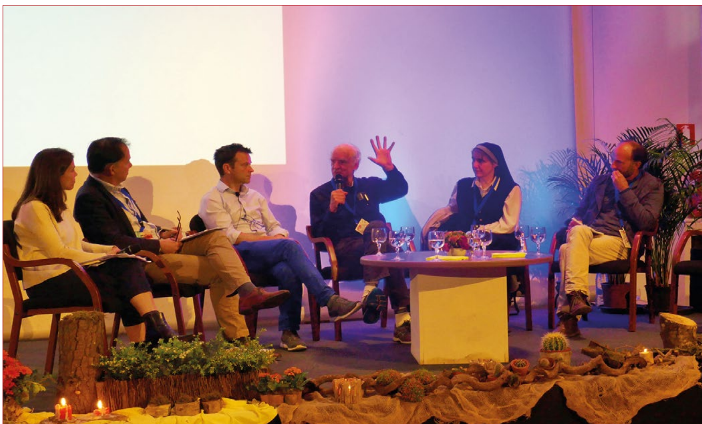
Professor Charles Taylor speaking during the final panel at the JMS 2018

The message from the John Main Seminar on how to develop a contemplative response to our global crisis