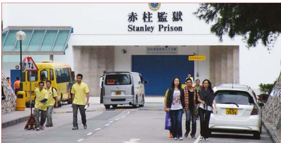
Stanley is one of the six maximum security facilities in Hong Kong