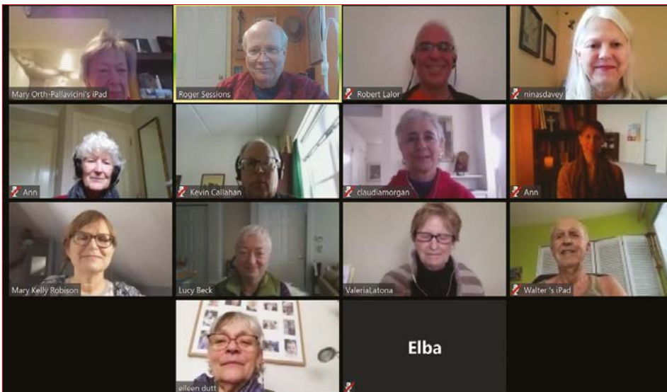
Community of Love sharing silence also in the digital world

Almost five years ago we started our first online WCCM group. We now have 15 groups meeting six days a week completely online with more than 100 people registered for using the online WCCM chapel. As a retrospective, I would like to share some reactions from those who participate.