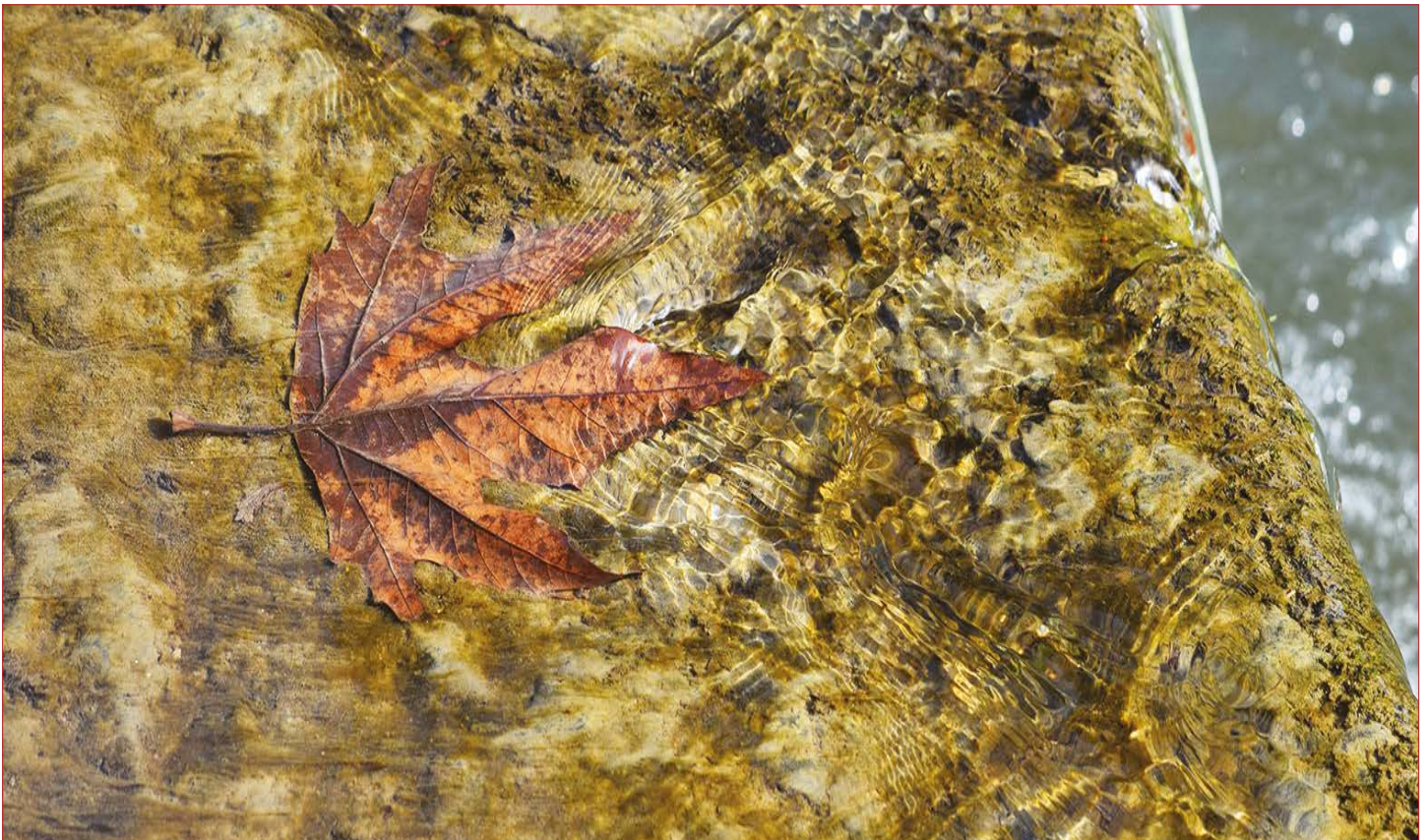
in Bonnevaux