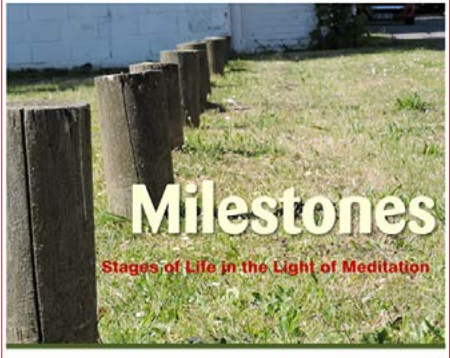
LAURENCE FREEMAN OSB

Childhood, adulthood, old age, and death are stages we pass through in unique personal ways. Meditation allows the self to develop naturally, moving us by stages beyond the ego.