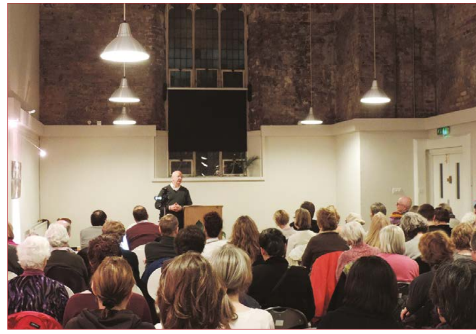
One of the regular webcasts transmitted from the London Meditatio Centre connecting the World Community

Since 2013 the Meditatio Centre has hosted retreats, workshops, talks, art exhibitions, bodywork, music for meditators from the UK and overseas (p. 6-7)